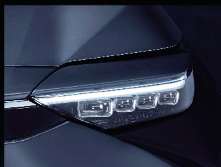
LED頭燈 LED Headlamps