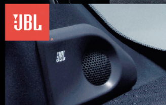
原廠JBL高級音響系統 連9個喇叭 JBL Premium Audio System with 9 Speakers