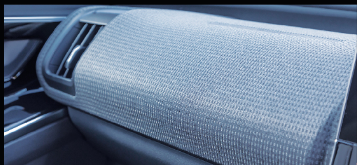
高級纖維織布儀表板 Fabric Instrument Panel