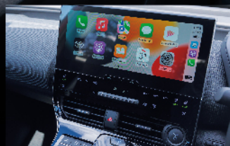
12.3吋原廠輕觸式屏幕 音響系統連原廠導航及 無線Apple CarPlay 12.3" Genuine Touch Screen Display with Genuine Navigation and Wireless Apple CarPlay