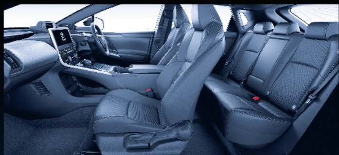
原廠人造皮革座椅(前排冷暖通風功能) Genuine Synthetic Leather Seats (Front Seats Equipped with Heated and Ventilated Function)