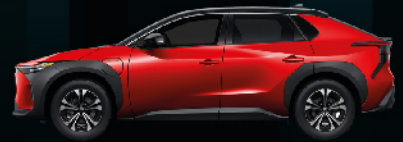
2TB 火熱紅 2TB EMOTIONAL RED