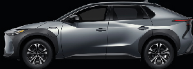
2WC 尊貴灰 2WC PRECIOUS METAL