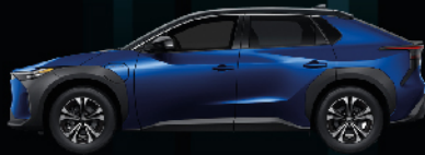
2MT 深靛藍 2MT DARK BLUE METALLIC