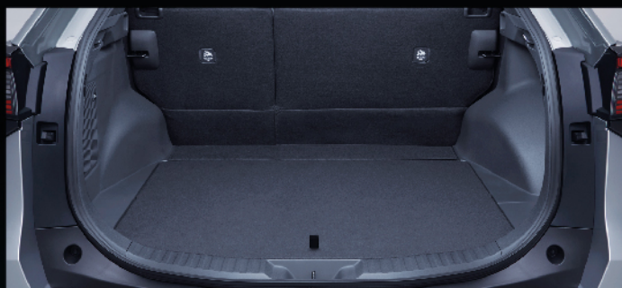
441公升特大尾箱連腳控電尾門 441-Litre Ultra-large Trunk with Power Back Door and Kick-open Function