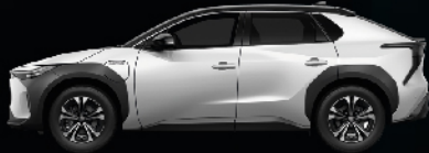
2VP 珍珠白 2VP PLATINUM WHITE PEARL MC.