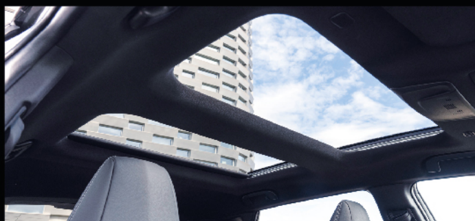
全景天幕連電動幕簾 Panoramic Sunroof with Power Sunshade