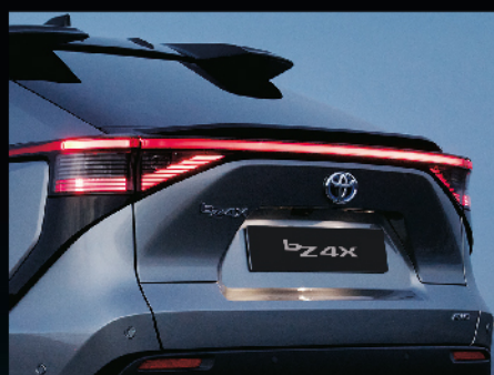
LED一體式尾燈 LED Rear Combination Lamp