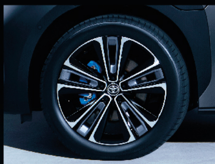
20吋合金輪圈 20" Alloy Wheels