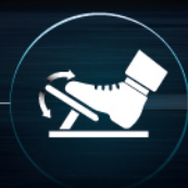
剎車動能回收加強按鈕 Regeneration Boost Switch