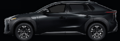
202 鋼琴黑 202 BLACK