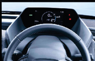
多功能顯示屏 Multi-information Display