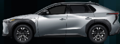
2MR 高雅銀 2MR PRECIOUS SILVER